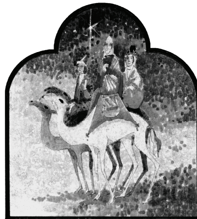
Magi from the east arrived

If you are moving away from the parish or moving within the community please contact the Admini- stration Office at 333-6060 so we may update our records. Thank you!